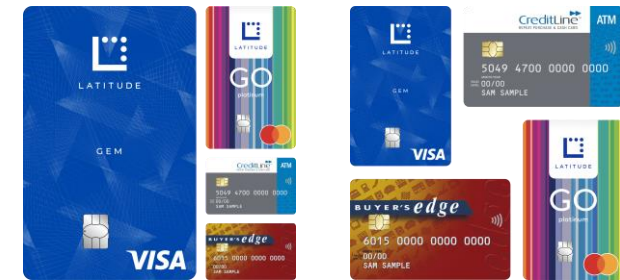
4 CARD HORIZONTAL LOCK-UP